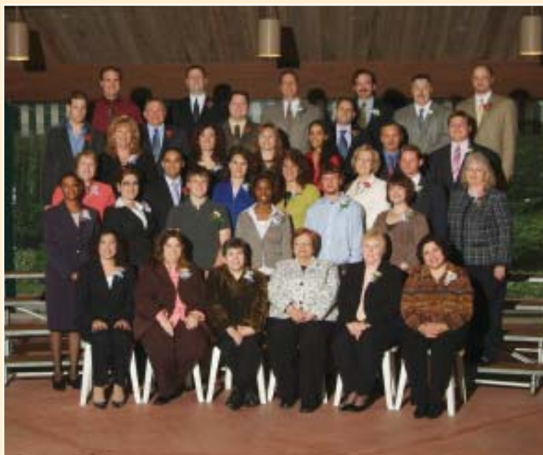
Class of 2007

to a group of over twenty leaders from the business, political and non-profit sectors. The CAPS put participants in the shoes of those struggling in poverty in Lorain County. Participants spent the equivalent of one month living in poverty. Taking care of their children, looking for work, and figuring out where to go for services, while at the same time trying to pay bills. The participants came to realize the obstacles that persons living in poverty must overcome on a daily basis.