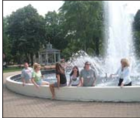
Summer interns make a splash in Ely Square's fountain