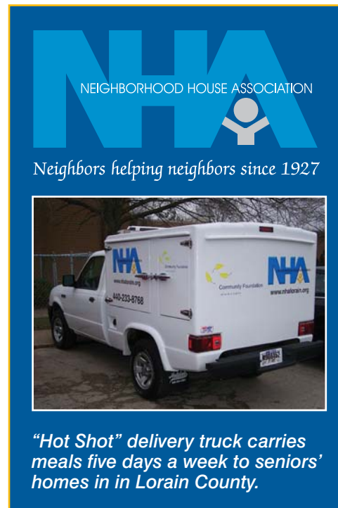
"Hot Shot" delivery truck carries meals five days a week to seniors' homes in Lorain County.

NHA provides more than 800 meals daily to seniors living across Lorain County. The Senior Nutrition program is identified easily by the three white and blue "Hot Shot" (half oven and half refrigerator) delivery trucks that carry meals five days a week to the seniors' homes in communities like Wellington, Wakeman, Oberlin, LaGrange, Grafton, Lorain and Elyria. Special circumstances qualify some recipients for the 7 day a week program with frozen meals being provided for the weekend. Congregate sites are also provided in Lorain and Elyria for socialization and group feeding. 164,000 meals were provided in 2007.