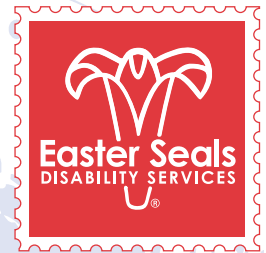
EASTER SEALS NORTHERN OHIO

We hope that you will join us in honoring these remarkable leaders and their impact on the community.