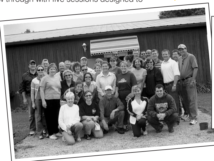
The Leadership Class of 2006 enjoys a moment of rest before tackling the famous ropes course.